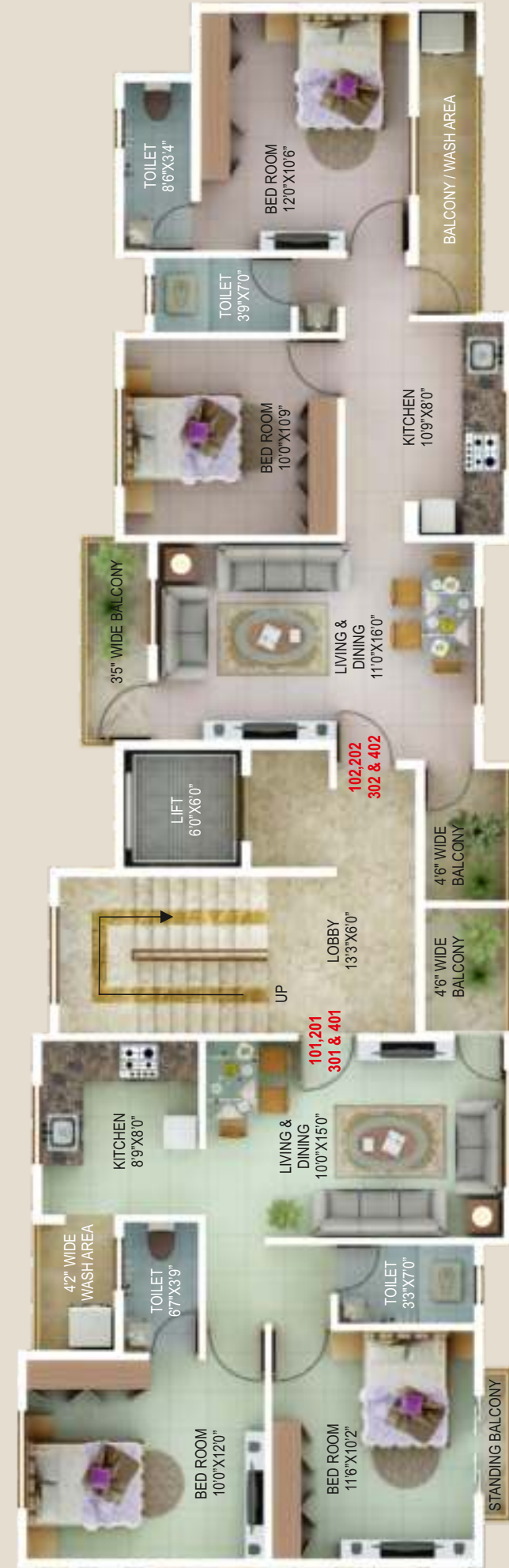
Typical 1st to 4th Floor Plan