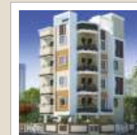
Devki Saptagiri III