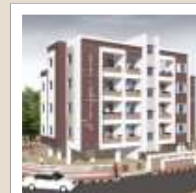
Devki Saptagiri II